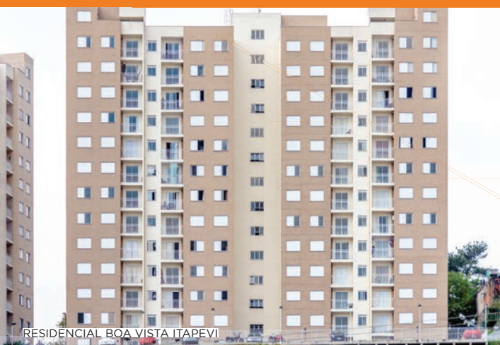
RESIDENCIAL BOA VISTA ITAPEVI